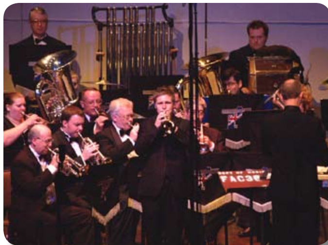
New England Brass Band at the International Trumpet Guild Conference 2007 (Univ. of Massachusetts, Amherst)

Complete information for each concert including location, time and directions may be found on the NEBB website at www.newenglandbrassband.org